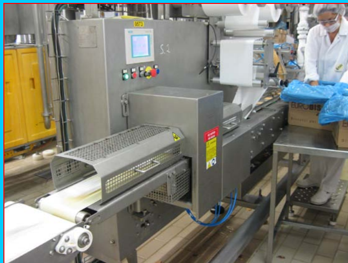
PLC CONTROL, TOUCH SCREEN