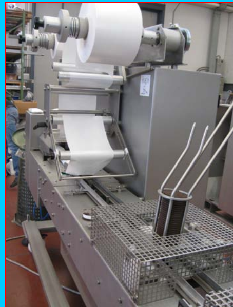
FIRST AND SECOND BISQUIT FEEDER